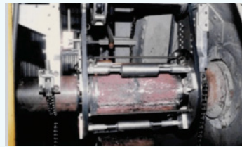
STEP 3 Stationary machining to return the fan shaft to straight, round, and concentric conditions