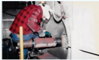
STEP 2 Preparation of weld for final machining