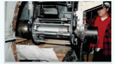
STEP 4 Shafting restored to within +/-0.0005" final machining tolerances